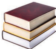
Books & Manuals