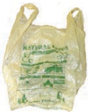
Plastic Bags with a #2 or #4