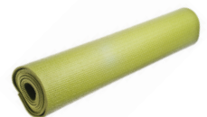
Yoga Mats (we're in Boulder County, after all)

*More to come!! We add new materials every year.