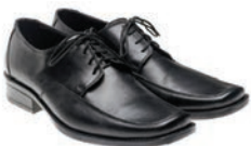
Paired Reusable Shoes