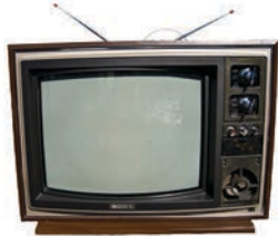
TVs & Monitors