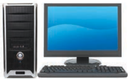
Computers & Electronics

All collected ONLY through Eco-Cycle's program!