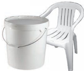
Big #2 Plastics