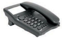
Office Phones (landline)