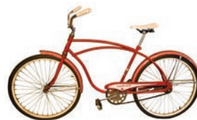
Bikes & Bike Parts