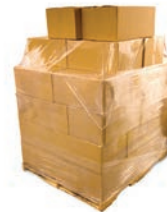
Stretch Wrap (Pallet Wrap)