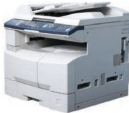
Copy Machines, Printers & Fax Machines